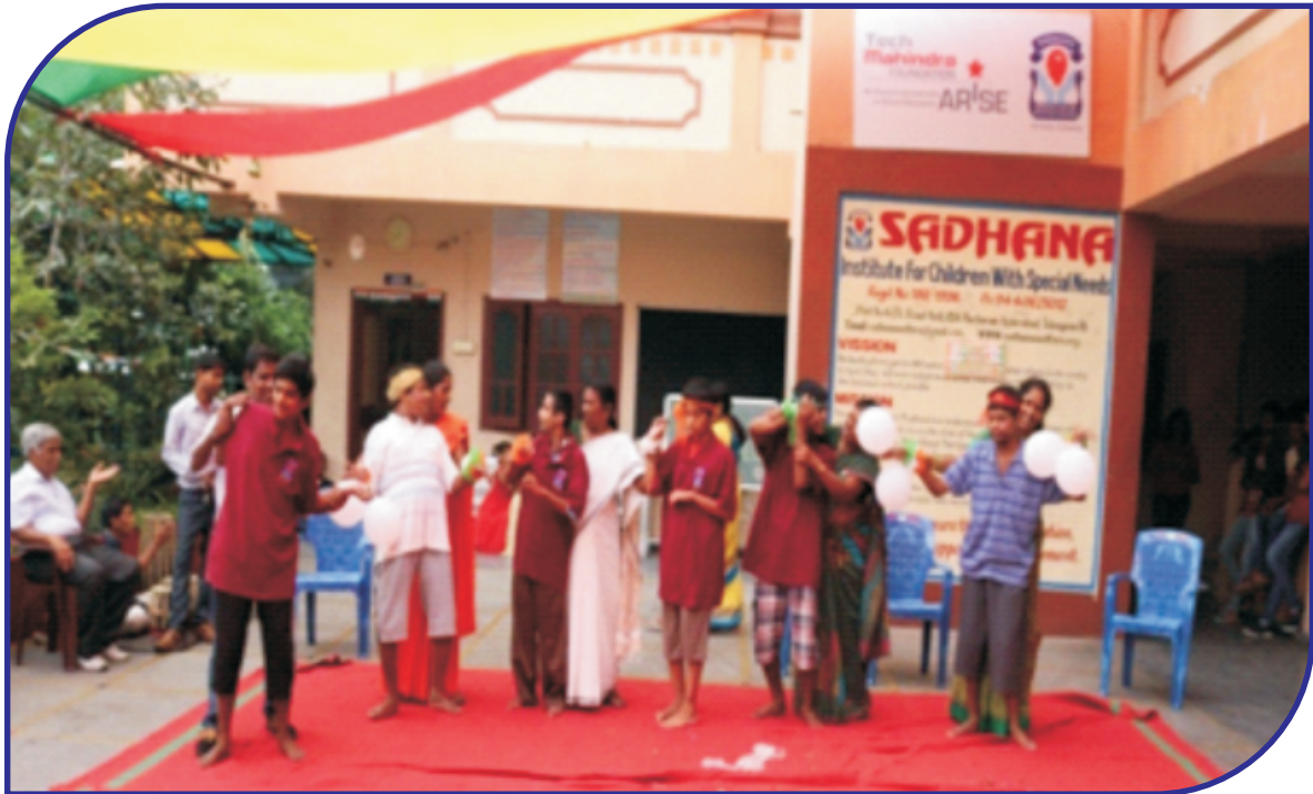
Various cultural programmes were conducted for the students.