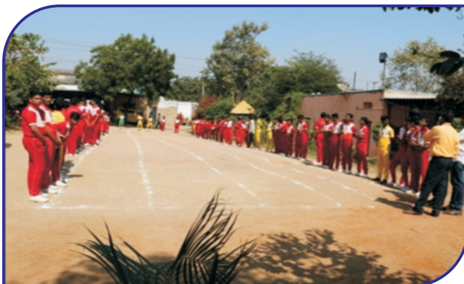
Students from Sri Chaitanya School, Habsiguda visited on 14th November 2018 and participated with our children in programmes. DPS, Nacharam students visited, conducted and participated in cultural activities