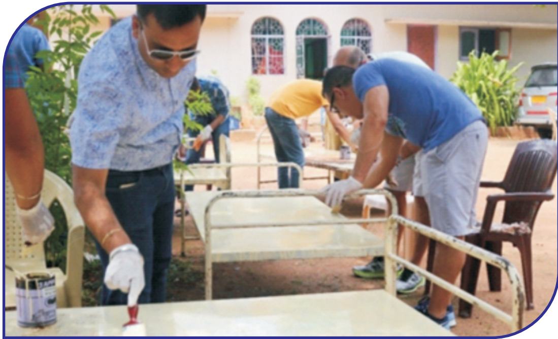
They have painted the cots and Benches (10no) and Planted ( 50 No ) at our center.