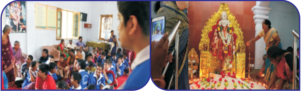
Children were taken to Sri Shiridi Sai baba Temple on the occasion of Gurupournami at Village Tekulasomaram, Valigonda Mandal, and DistrictYadadri