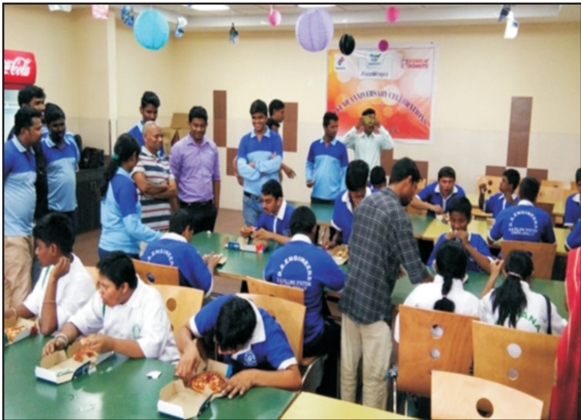
On 13 th August we had taken the students for outing DOMINOS (Jubilant Food Industries at Moulali). They have explained how the PIZZA is prepared